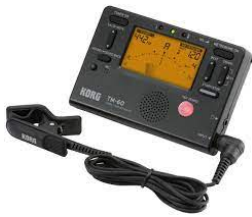
Korg Tuner/Metronome Combo (with pick-up microphone)