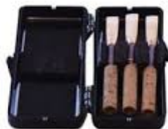
Oboe Reed Case