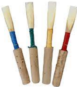
2 'Medium' Strength Singin' Dog Brand Oboe Reeds Students should typically get a new reed each month