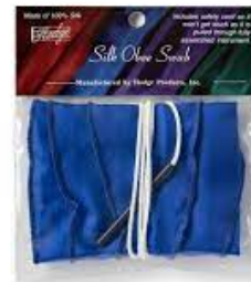
Silk Oboe Swab (other materials may get stuck in the instrument)