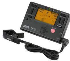
Korg Tuner/Metronome Combo (with pick-up microphone)