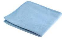
Polishing Cloth All-Purpose or for 'Lacquered' instruments