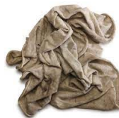
Old Rag for wiping excess oil and grease (not sold in stores)