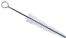
Trumpet Mouthpiece Cleaning Brush