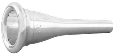
Holton-Farkas MC Horn Mouthpiece