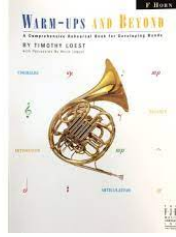
Warm ups and Beyond F Horn Book