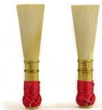
2 'Medium' Strength Singin' Dog Brand Bassoon Reeds Students should typically get a new reed each month