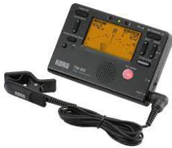
Korg Tuner/Metronome Combo (with pick-up microphone)