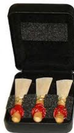
Bassoon Reed Case