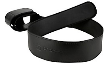
Protec Leather Bassoon Seat Strap with Adjustable Cup