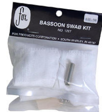
Bassoon Swab Kit (other materials may get stuck in the instrument)